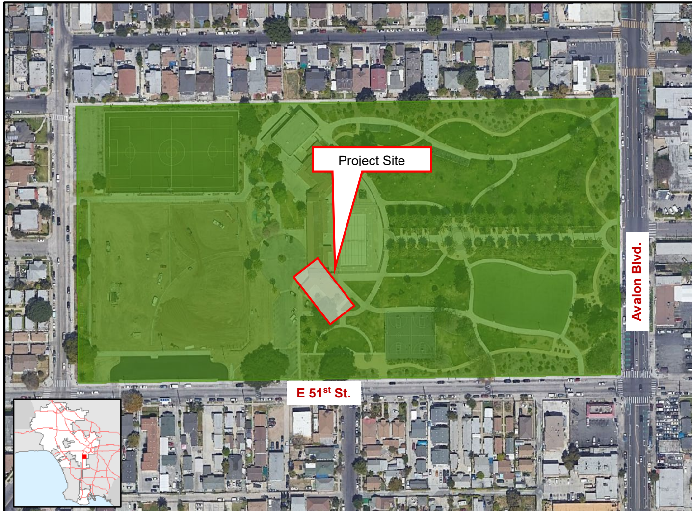
Figure 1. Project Location